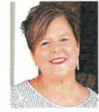
Dawn Brand Preschool/Children