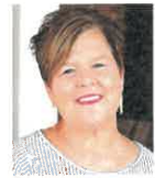
Dawn Brand Preschool/Children