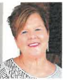
Dawn Brand Preschool/ Children