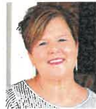
Dawn Brand Preschool/Children