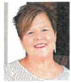
Dawn Brand Preschool/ Children