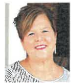
Dawn Brand Preschool/Children